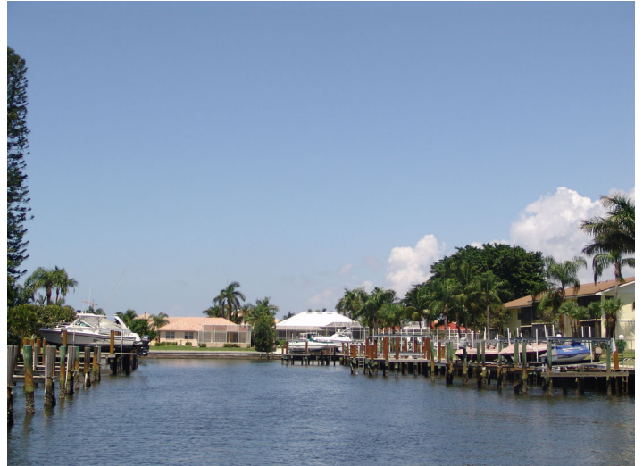
2) Canal View