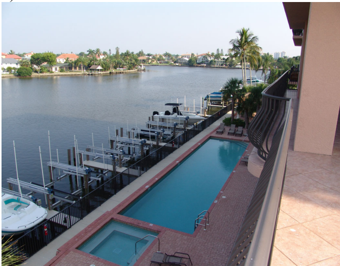
3) Concept boat docks and pool behind building