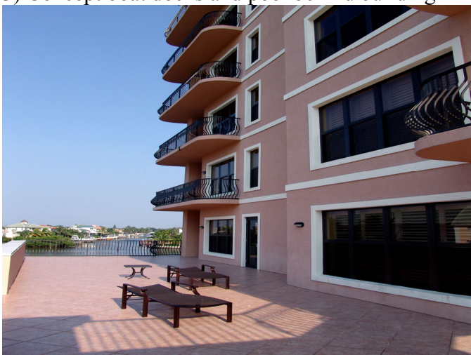
5) Mid-rise building