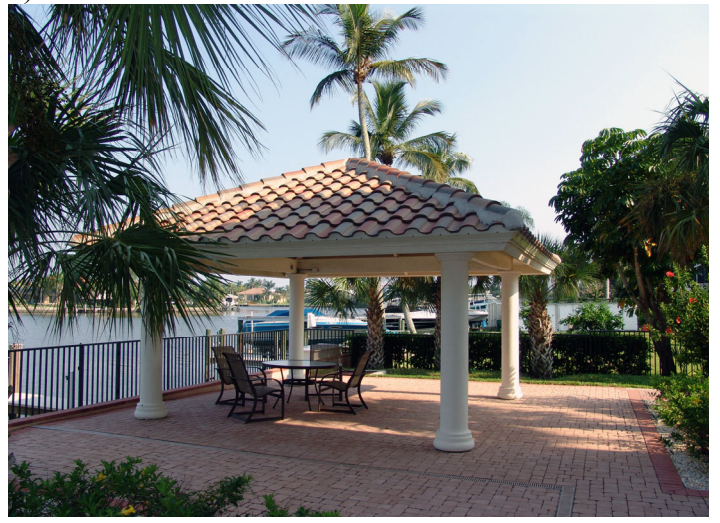
4) Tiki hut