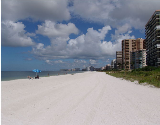
1) Marco Islands crescent 6 mile beach